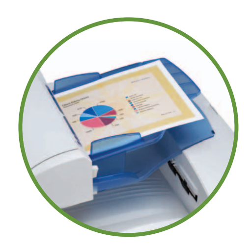
Accommodate lengthy, multi-page documents (up to 47.2" long) with the 70-sheet Automatic Document Feeder.